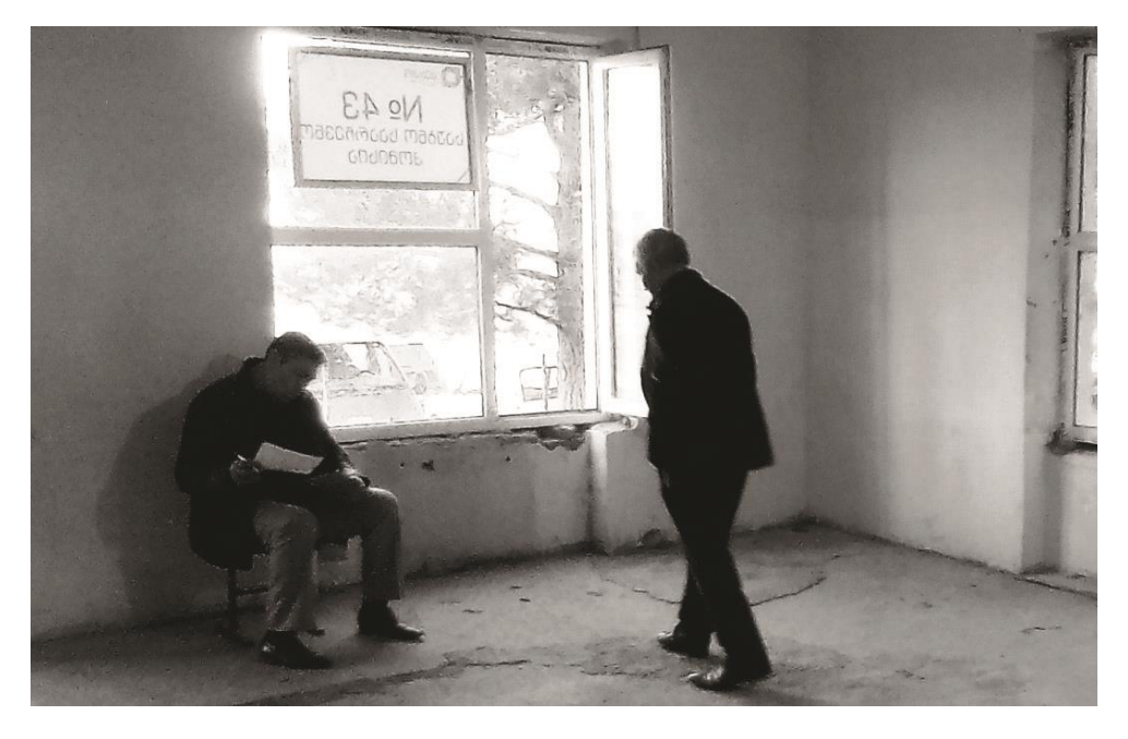
Unidentified person in the vicinities of the precinct N43 in Iormuganlo village in Sagarejo election district N11; he is recording the names of the voters who came to vote

numbers. It was happening in the room next to the polling station. HRC monitors observed similar facts in other precincts too. For example, a person holding unclear lists was in the neighboring precinct N43, who was recording the names of the voters, who had come to vote.