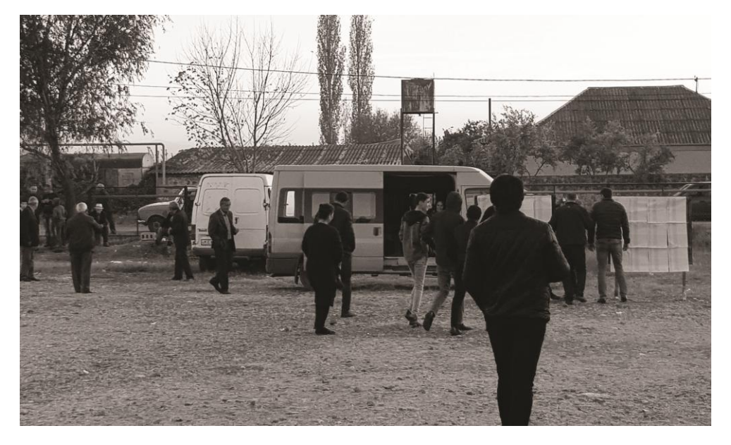
This mini-bus brought voters to the polling station N12 in Sabirkendi village

Mobilization of voters continued all day long nearby the polling station N12 in Sabirkendi village. Namely, the representative of the International Observatory of Advocates and Lawyers was meeting voters at the polling station, who were delivered by mini-buses, and accompanied them to the entrance of the building. The mini-bus brought voters to the polling station N12 five times. Each time, the representative of the International Observatory of Advocates and Lawyers actively assisted them and organized their polling process. HRC observer gave a remark to the representative of the organization but he continued active mobilization of voters and campaigning.