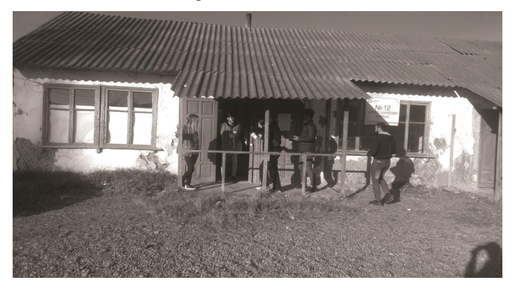
Sabirkendi village, polling station N12

Insufficient space in the polling stations was problem in Marneuli municipality. For example in Marneuli polling station N68, there were not adequate registration tables. All day long, the registrars were sitting at school desks and when serving the voters they had to stand up and hand in documentation. Inadequate infrastructure, bad smell and environment was in the polling station N12 in Sabirkendi village.